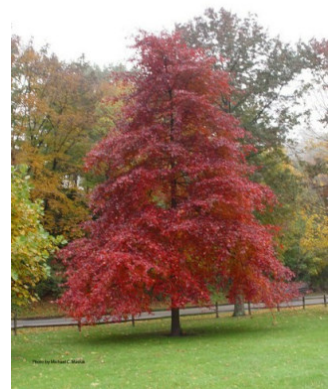
BLACKGUM IN FALL