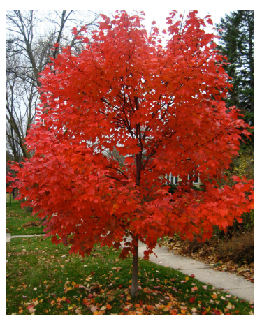
AUTUMN BLAZE RED MAPLE