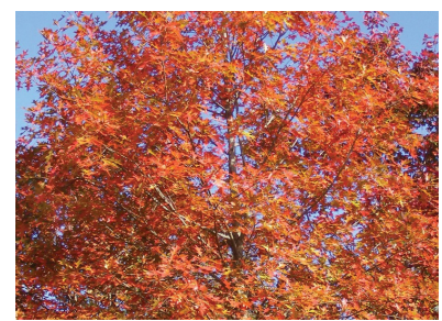
NUTTALL OAK FALL COLOR