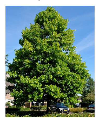
MATURE TULIP POPLAR