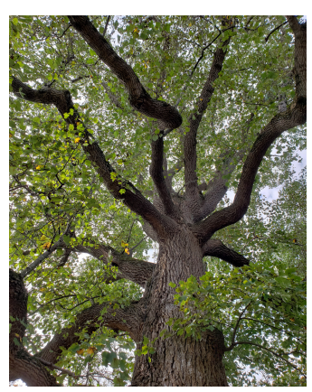
BEAUTIFUL BRANCHING STRUCTURE