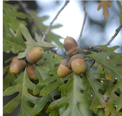
WHITE OAK ACORNS