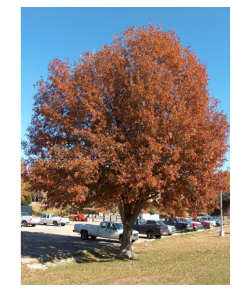
MATURE NUTTALL OAK