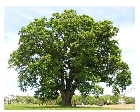
MATURE WHITE OAK