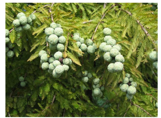
BALD CYPRESS CONES