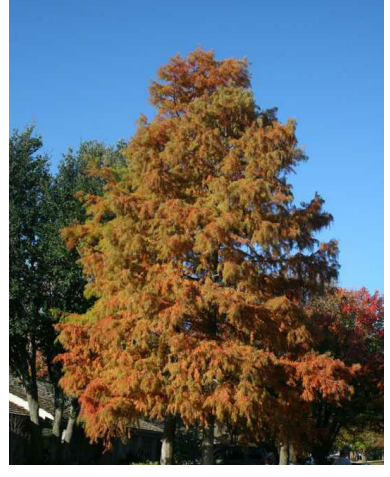
BALD CYPRESS IN AUTUMN

Great canopy tree for tighter spaces; roots will not buckle pavement