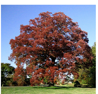
WHITE OAK FALL COLOR

Beautiful fall color and excellent habitat for a wide variety of fauna (including bats!)