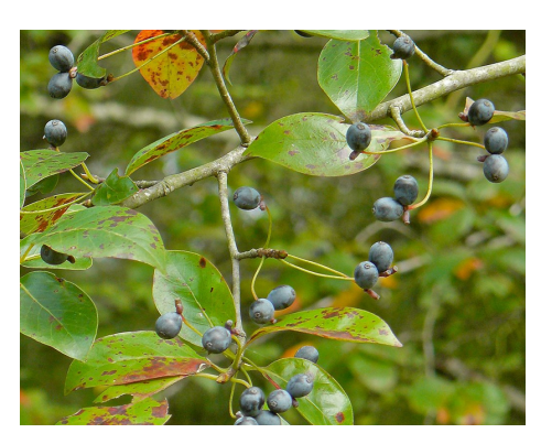
LEAVES AND BERRIES IN SUMMER