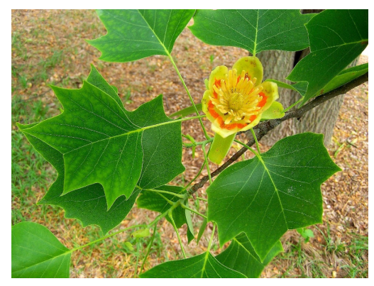
TULIP POPLAR LEAVES AND BLOOM

Cat-shaped leaves are bright green; blooms in early summer