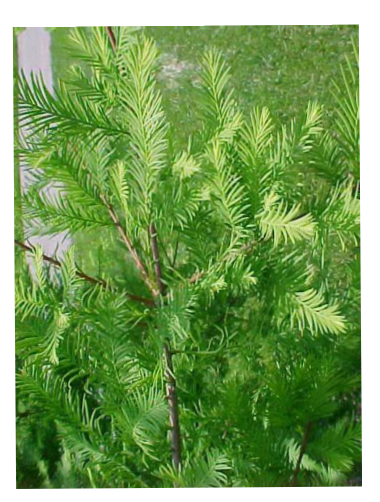
BALD CYPRESS FOLIAGE