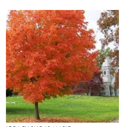
LEGACY SUGAR MAPLE

Can tolerate average, welldraining medium to wet soil